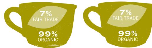
2010 2011 TEA SOURCING

Fair Trade sets a bottom price for living-wage prices. We pay more. Rainforest Alliance works to conserve biodiversity and ensure livelihoods. We do more. Whole Trade means higher standards. We do all of this while producing some seriously excellent coffee and tea. We manage to care completely about how each and every one of our products is produced while simultaneously creating beautiful tastes.